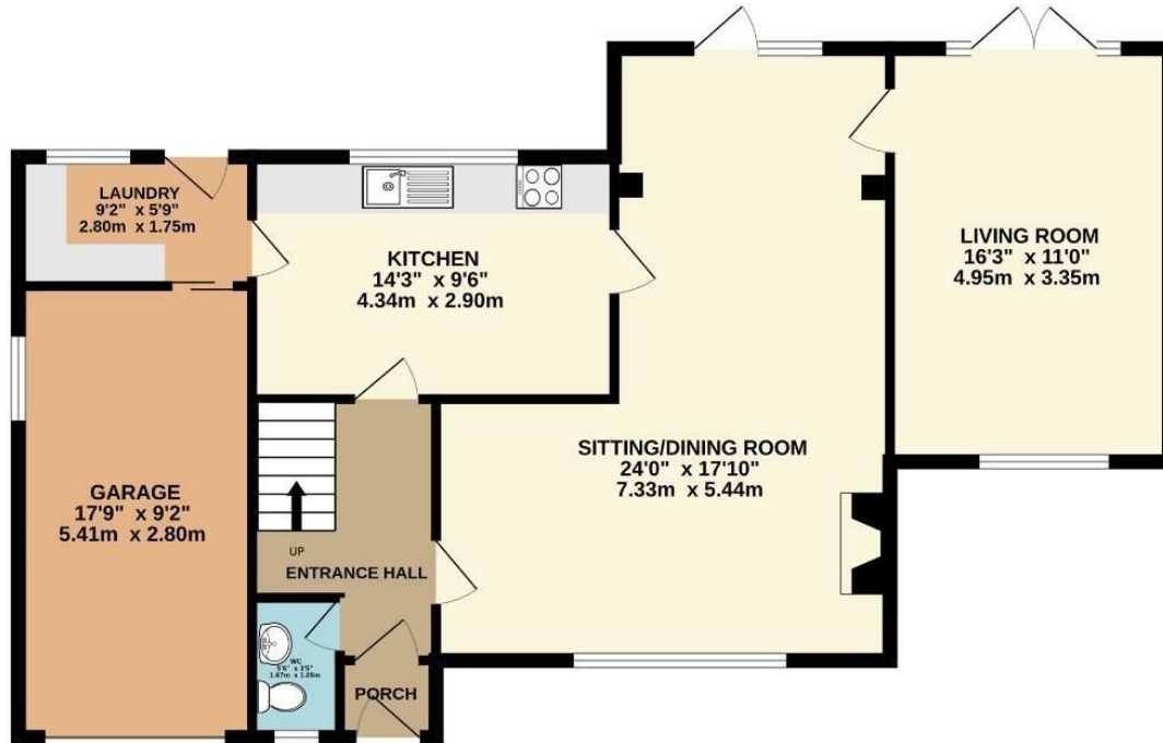
GROUND FLOOR 943 sq.ft. (87.6 sq.m.) approx.