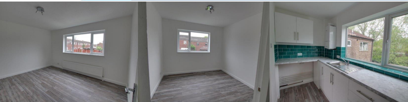
GROUND FLOOR 495 sq.ft. (46.0 sq.m.) approx.