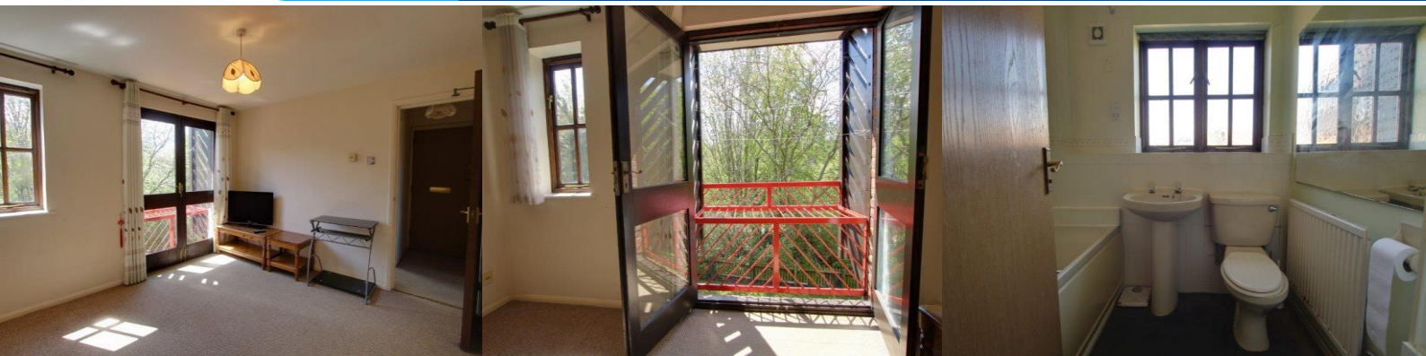
GROUND FLOOR 526 sq.ft. (48.9 sq.m.) approx.