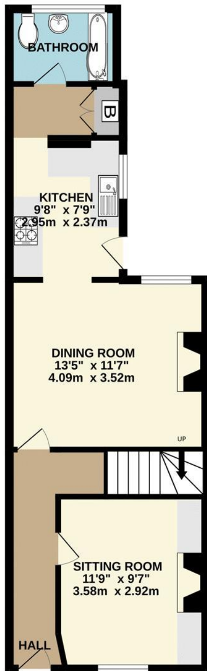
GROUND FLOOR 482 sq.ft. (44.8 sq.m.) approx.