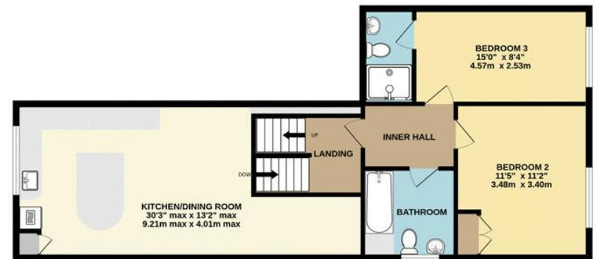
1ST FLOOR 834 sq.ft. (77.5 sq.m.) approx.