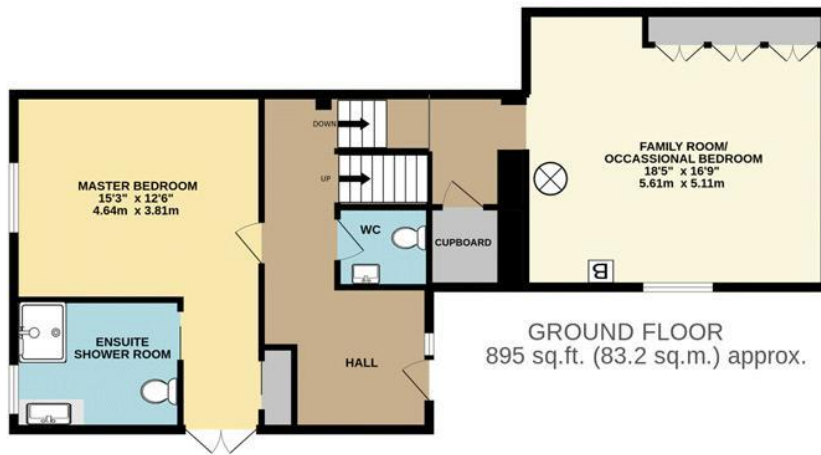
GROUND FLOOR 895 sq.ft. (83.2 sq.m.) approx.