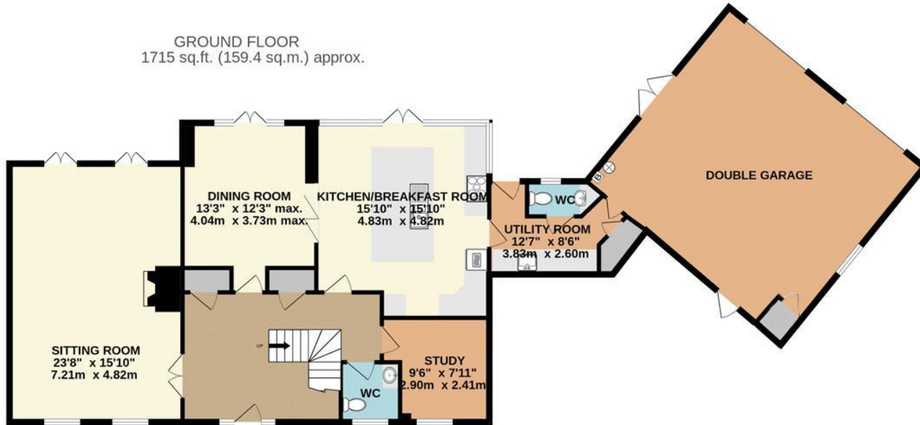
GROUND FLOOR 1715 sq.ft. (159.4 sq.m.) approx.