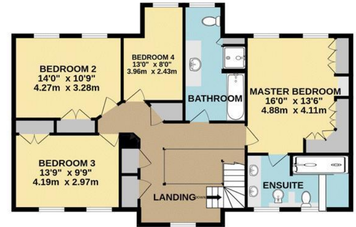
1ST FLOOR 1034 sq.ft. (96.1 sq.m.) approx.