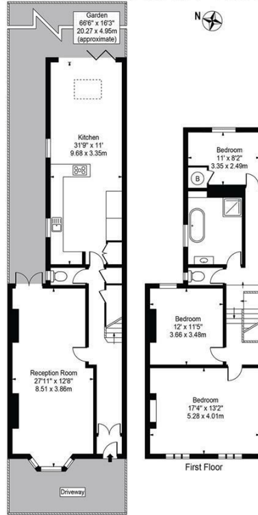
For Illustration Purposes Only - Not To Scale - Floor Plan by interDesign Photography www.interdesignphotography.com This floor plan should be used as general outline for guidance only. All measurements are approximate and for illustration purposes only as defined by the RICS Code of Measuring Practice ©2016.

Kemble Road, SE23 2DH Approx. Gross Internal Area 1584 Sq Ft - 147.16 Sq M