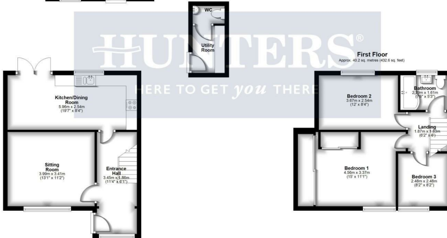
First Floor Approx. 40.2 sq. metres (432.6 sq. feet)

Total area: approx. 103.7 sq. metres (1115.9 sq. feet)