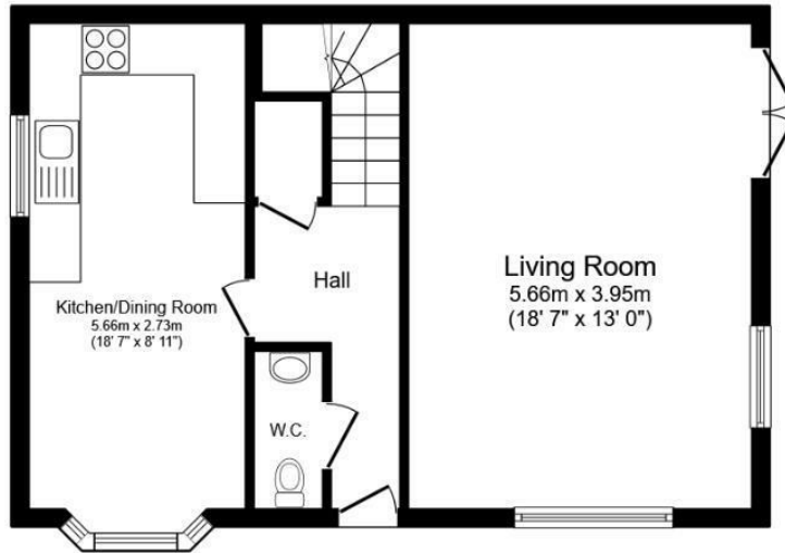
Ground Floor Floor area 47.9 m 2 (516 sq.ft.)