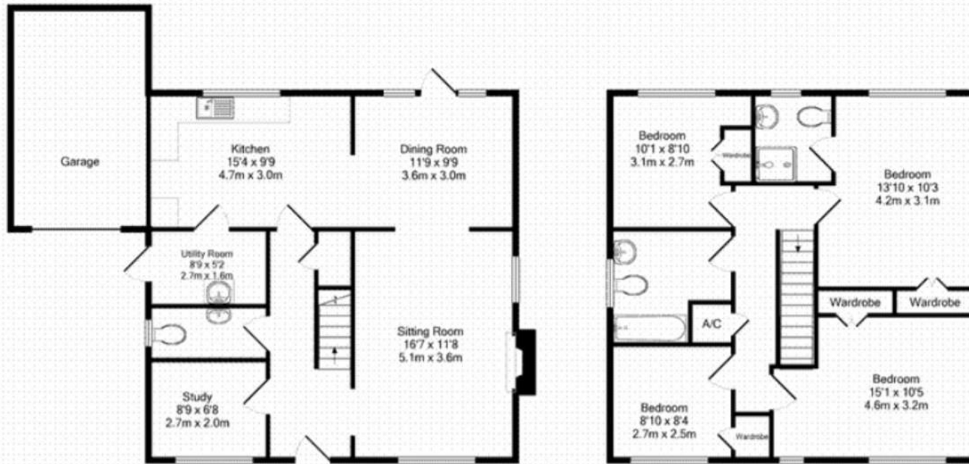
GROUND FLOOR APPROX. FLOOR AREA 858 SQ.FT. (79.7 SQ.M.)