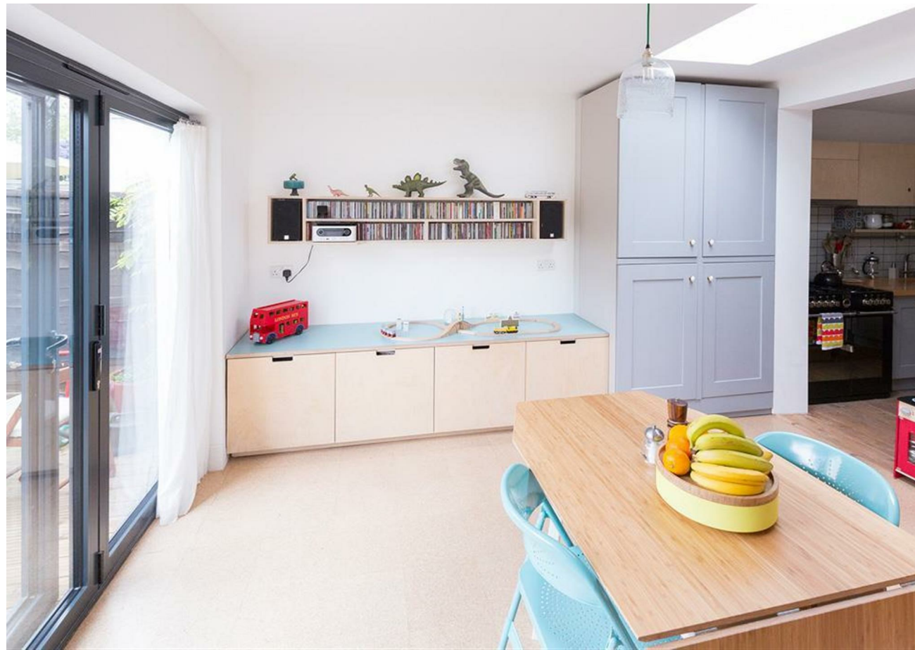
Lounge 12'9" x 9'10"