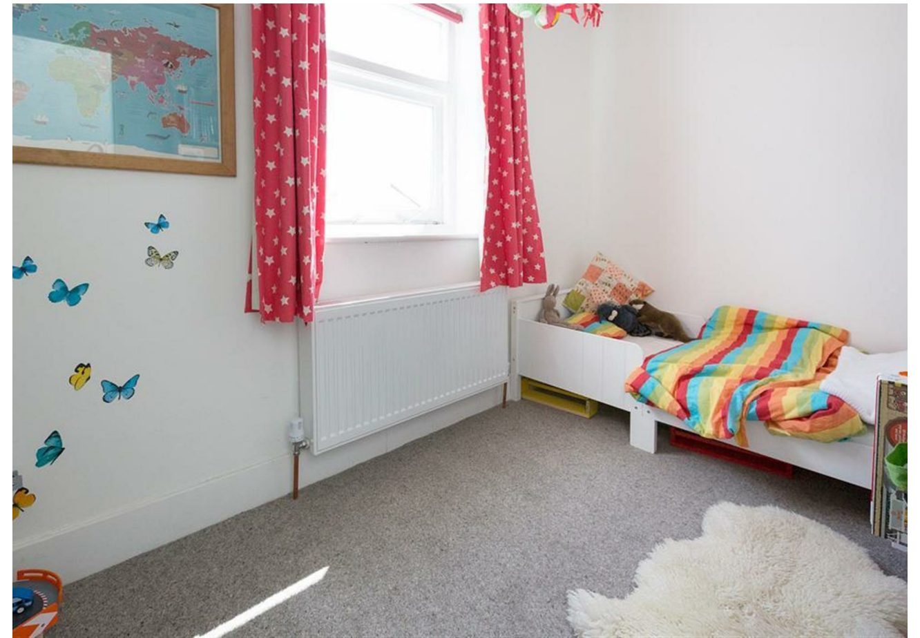
Bedroom 10'9" x 6'2"