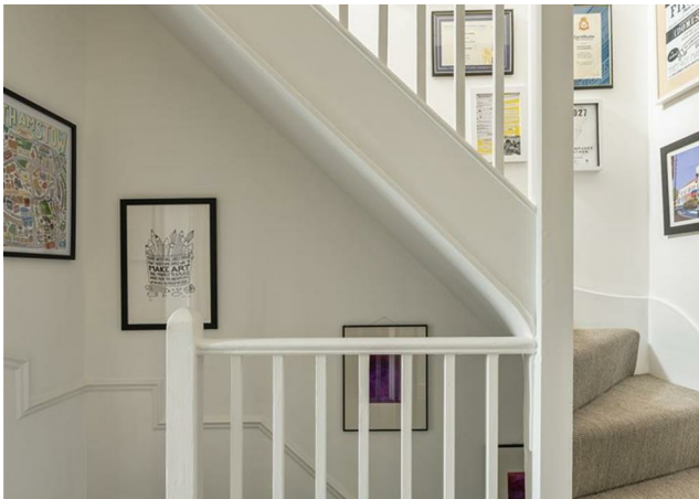
Reception 11'3" x 14'0"