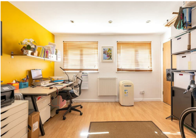
Bedroom 11'3" x 9'1"