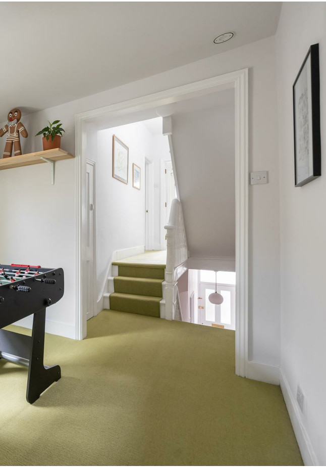
Play Room 10'1" x 9'8"