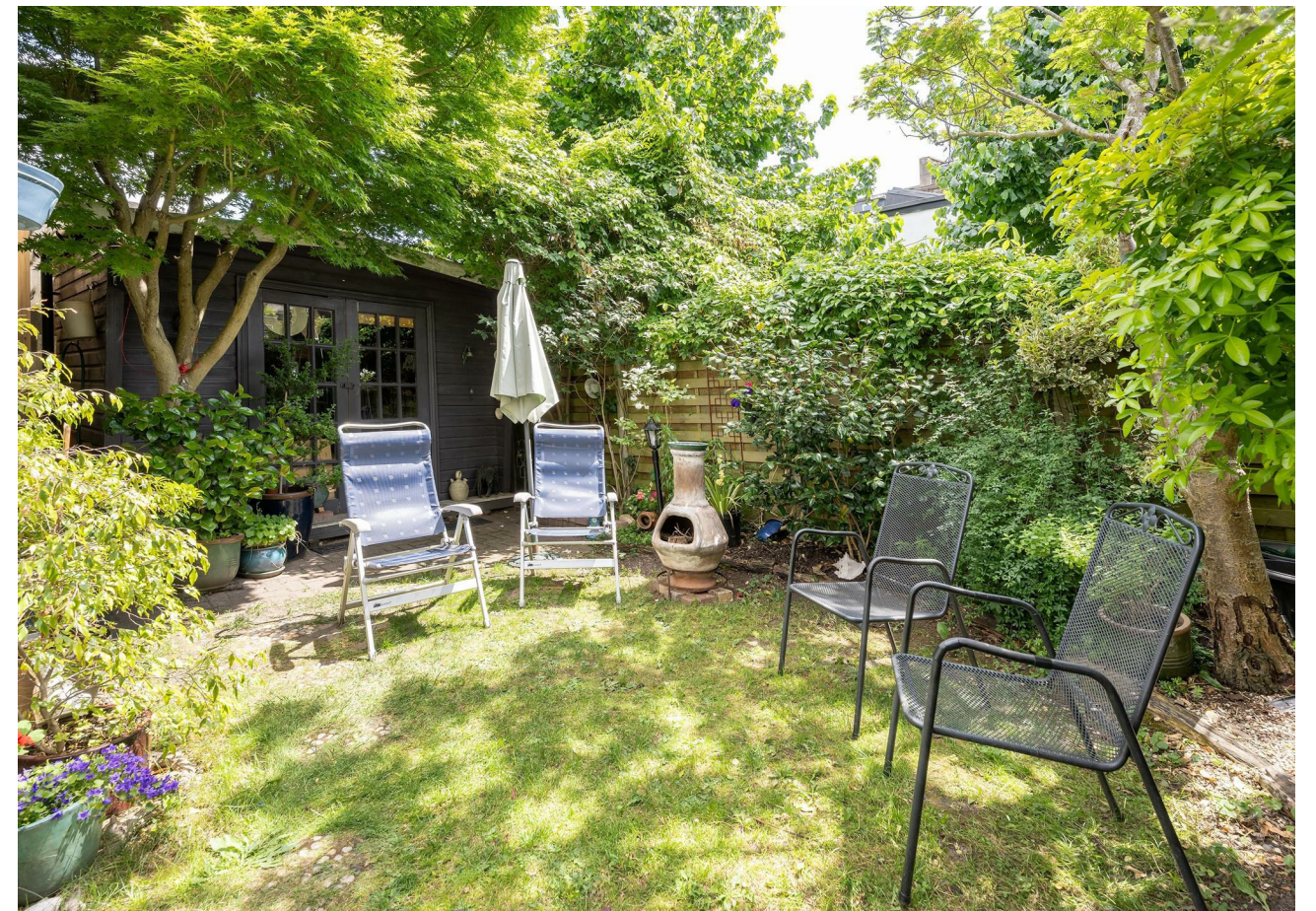
Garden 35'9" x 29'2"