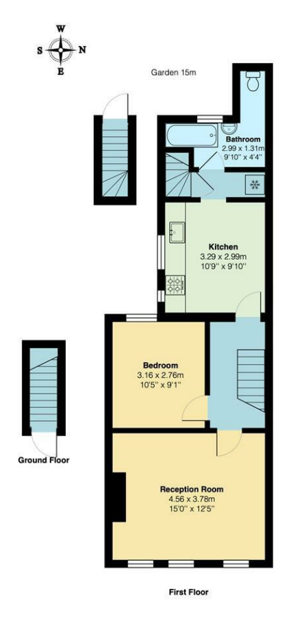
Total Area: 55.0 m<sup>2</sup> ... 592 ft<sup>2</sup>