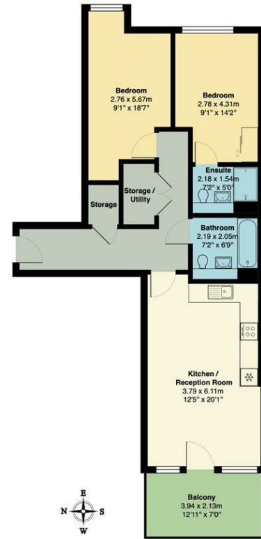
Seventh Floor Total Area: 73.9 m 2 ... 795 ft 2 (excluding balcony) All measurements are approximate and for display purposes only