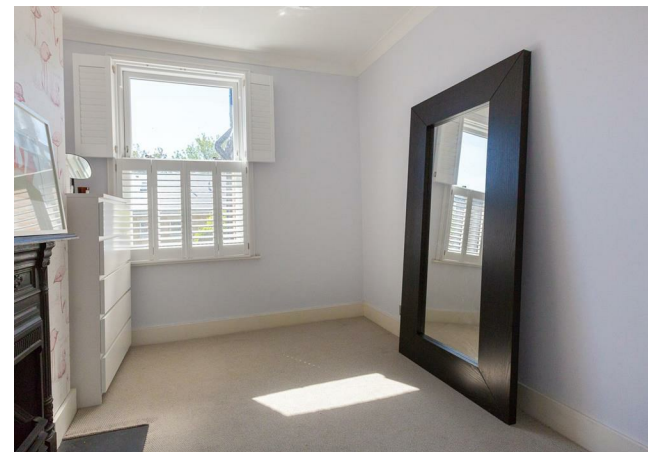
Lounge / Diner