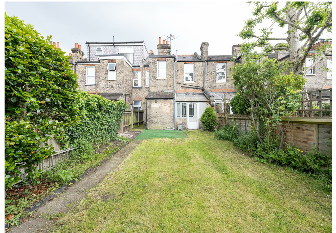
Garden approx. 43'11" x 20'0"