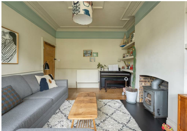
Reception 11'3" x 16'2"