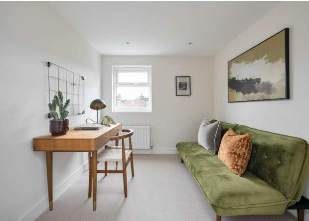
Reception 10'4" x 12'8"