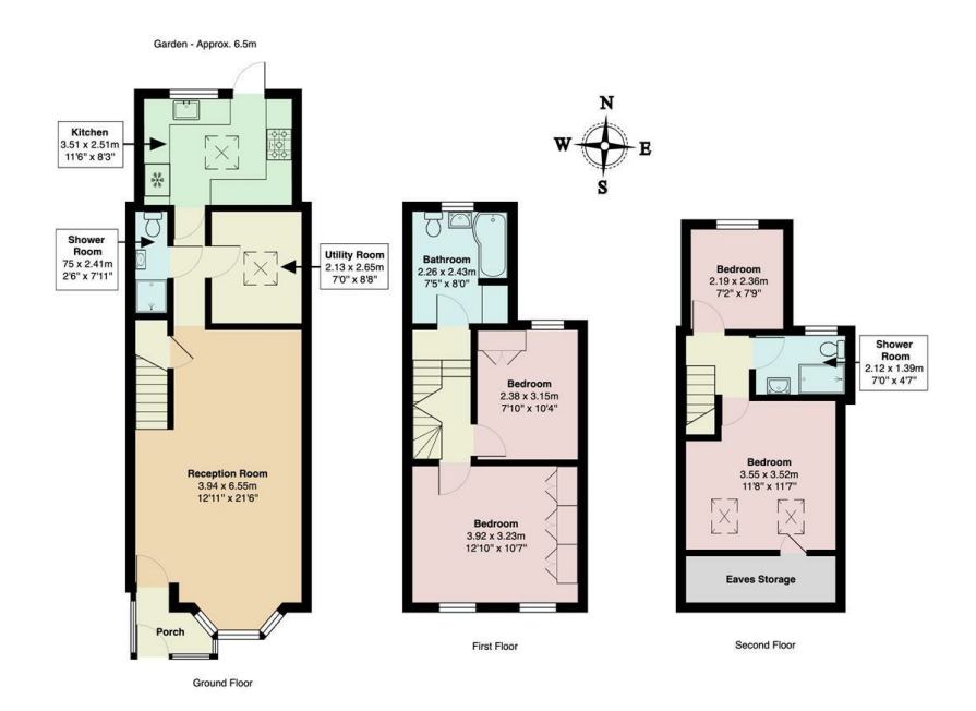
Total Area: 103.9 m² ... 1119 ft² (excluding eaves storage)