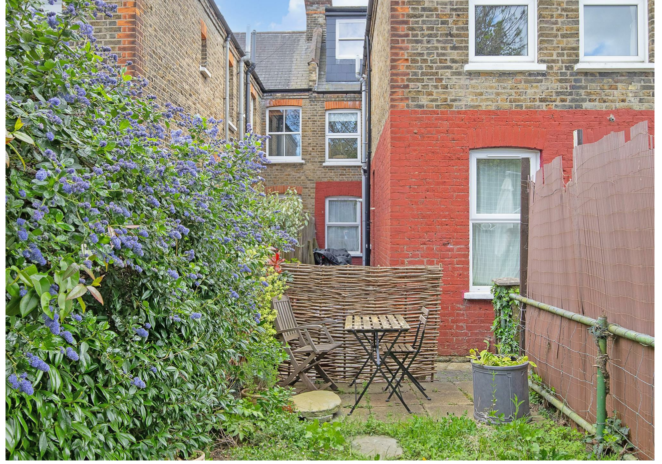
FOLLOW US → @STOWBROTHERS STOWBROTHERS.COM