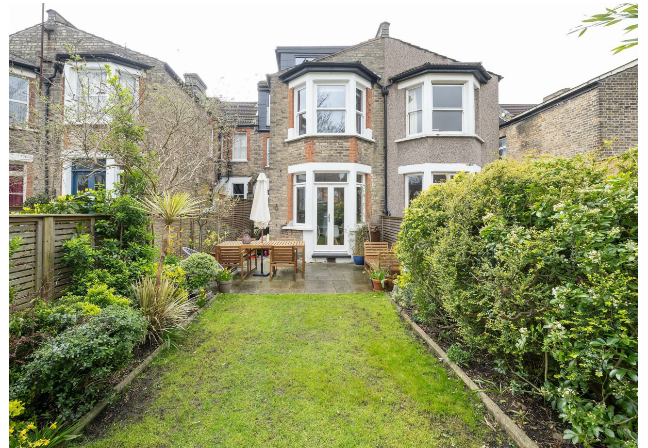
Garden approx. 36'1" x 16'2"