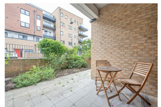
24'11" x 17'8"