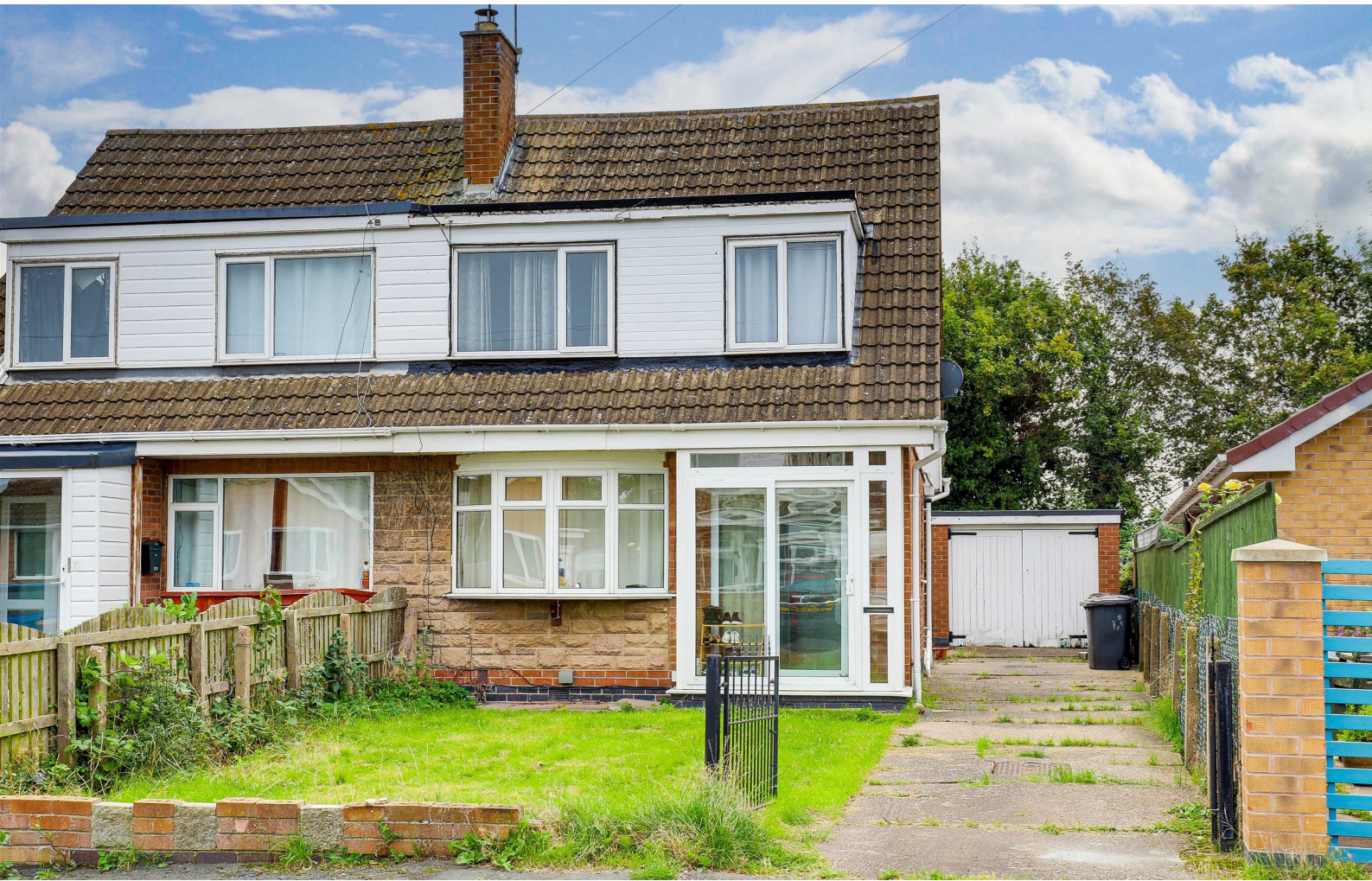
Oakland Grove, Calverton, Nottinghamshire NG14 6GN