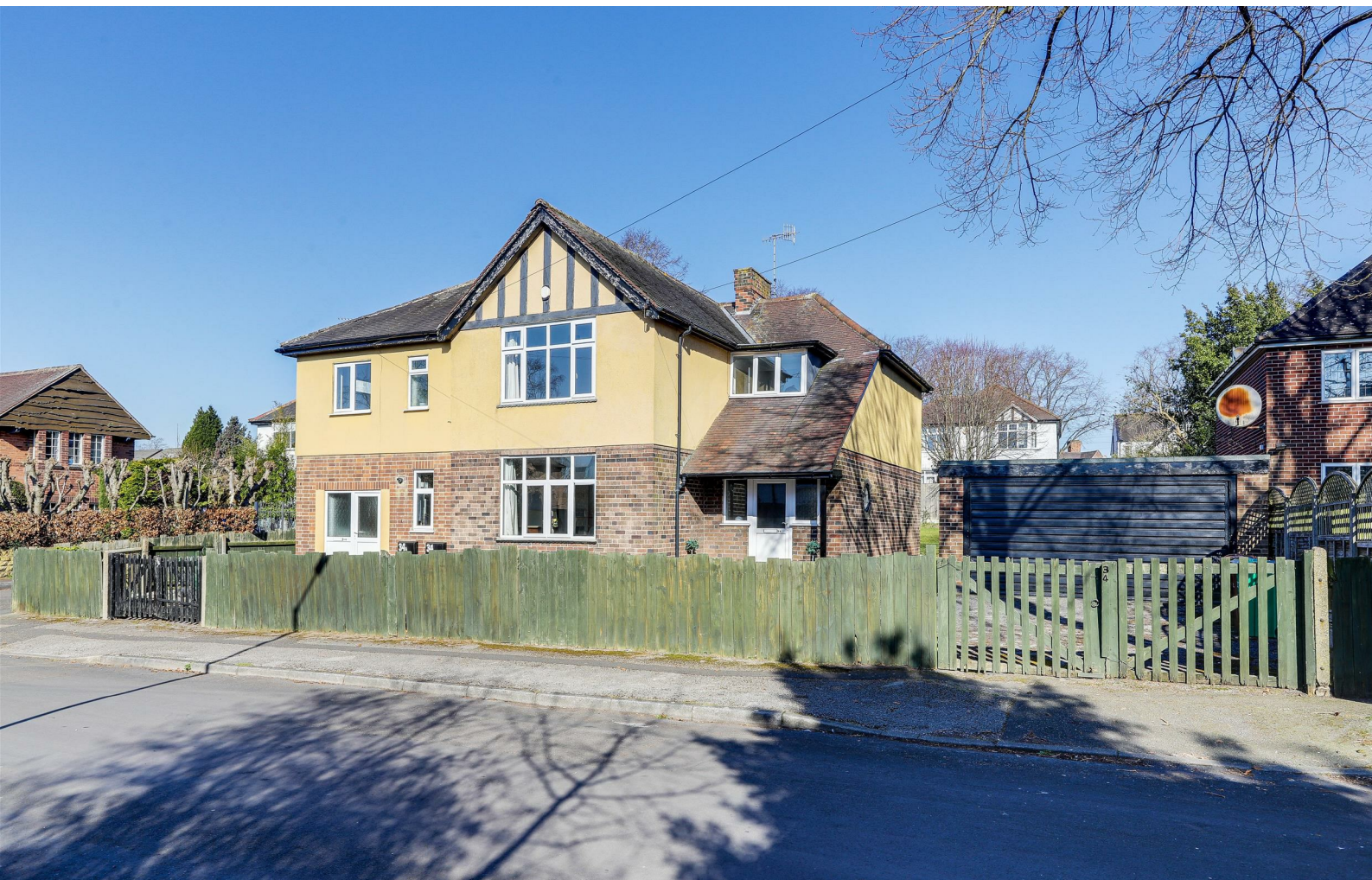
Hartington Road, Sherwood, Nottinghamshire NG5 2GU