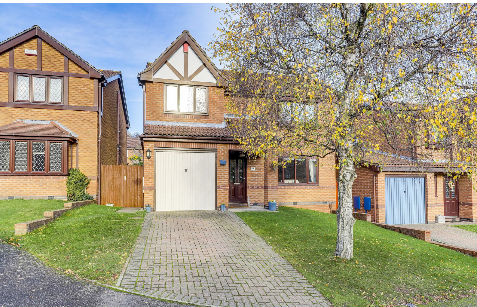
Glanton Way, Nottingham, NG5 8SN