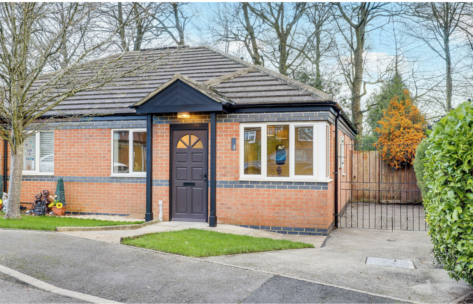
Snowdon Close, Bestwood Park, Nottinghamshire NG5 5PN