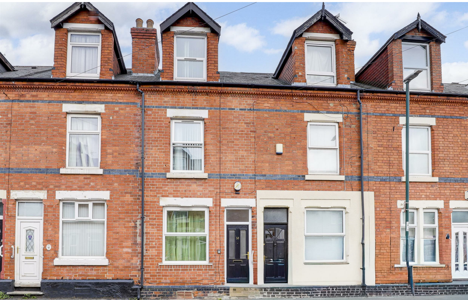
Kentwood Road, Sneinton, Nottinghamshire NG2 4FL