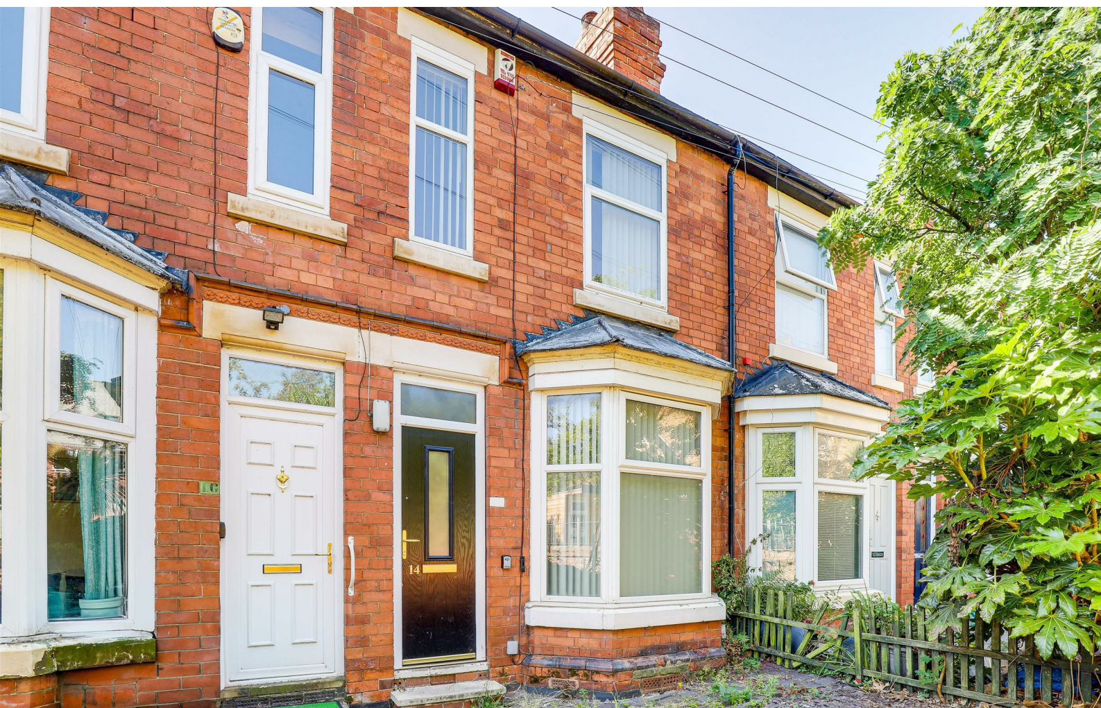
Scotholme Avenue, Forest Fields, Nottinghamshire NG7 6FB