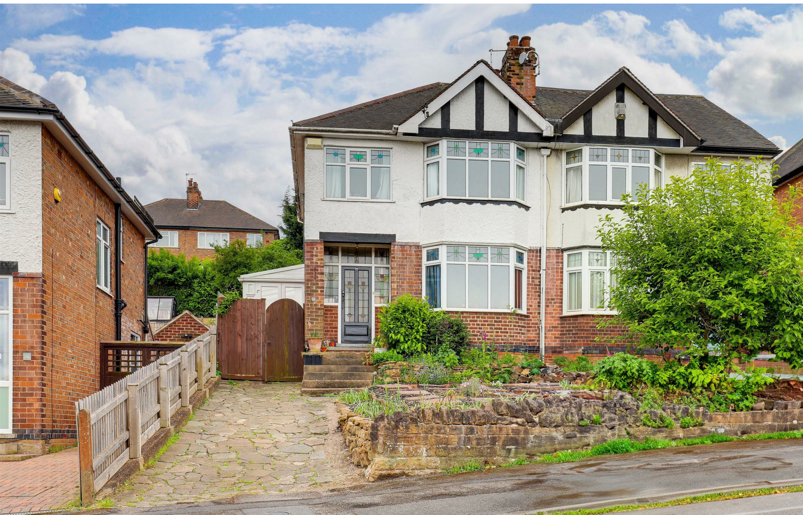
Retford Road, Sherwood, Nottinghamshire NG5 1FZ