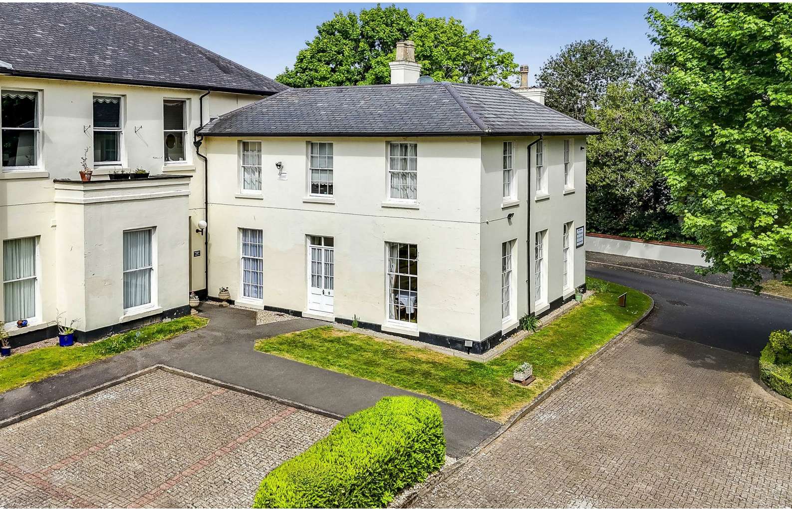
The Cedars, Sherwood, Nottinghamshire NG5 3FP