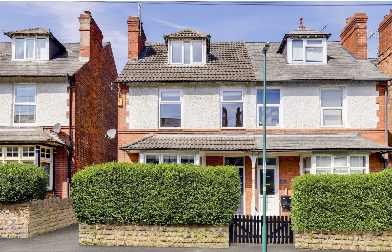
Bingham Road, Sherwood, Nottinghamshire NG5 2EP