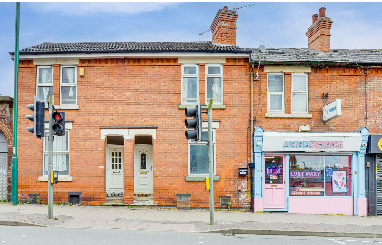
Ilkeston Road, Nottingham, Nottinghamshire NG7 3HE