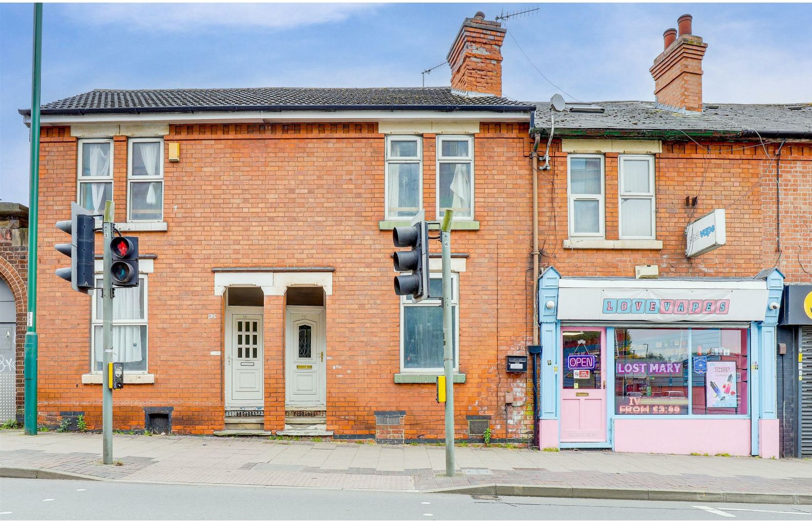
Ilkeston Road, Nottingham, Nottinghamshire NG7 3HE