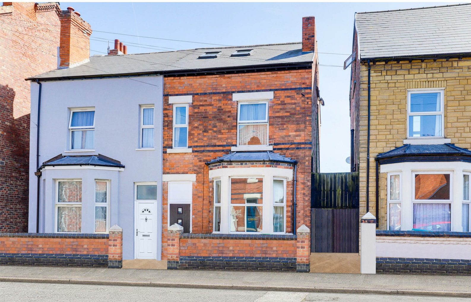
Wiverton Road, Forest Fields, Nottinghamshire NG7 6NP