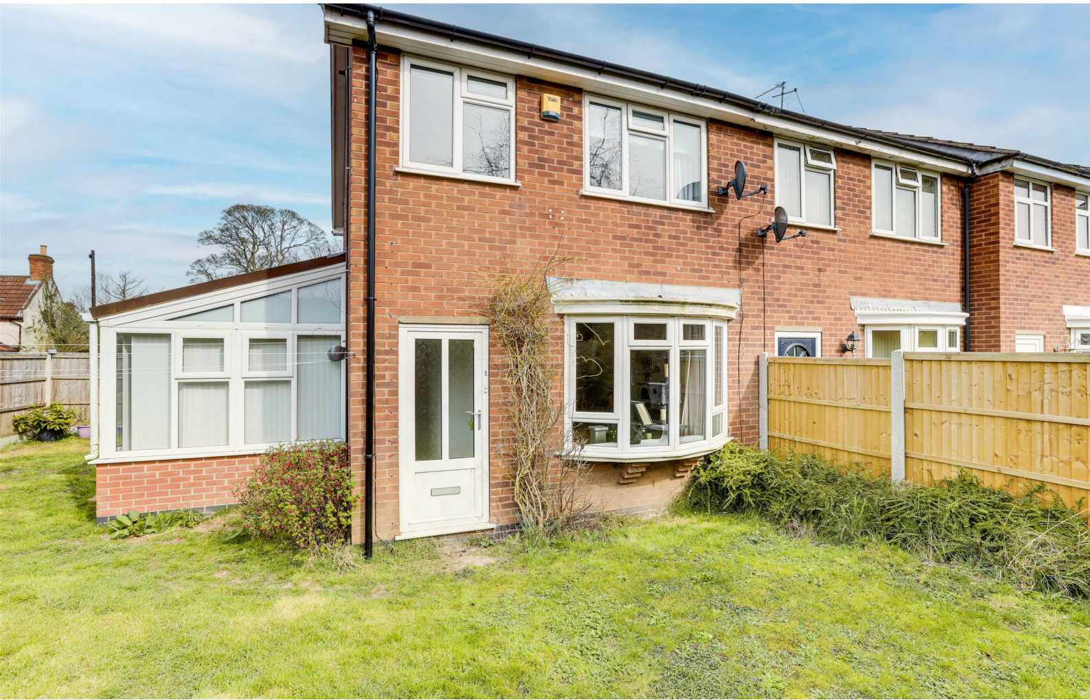
Plumtree Gardens, Calverton, Nottinghamshire NG14 6GE