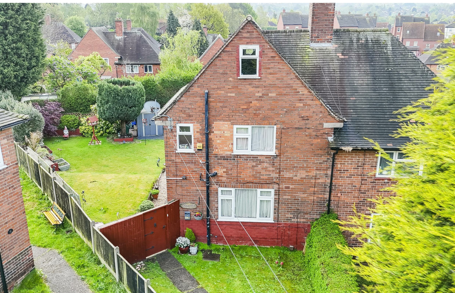
Berwick Close, Arnold, Nottinghamshire NG5 6EA