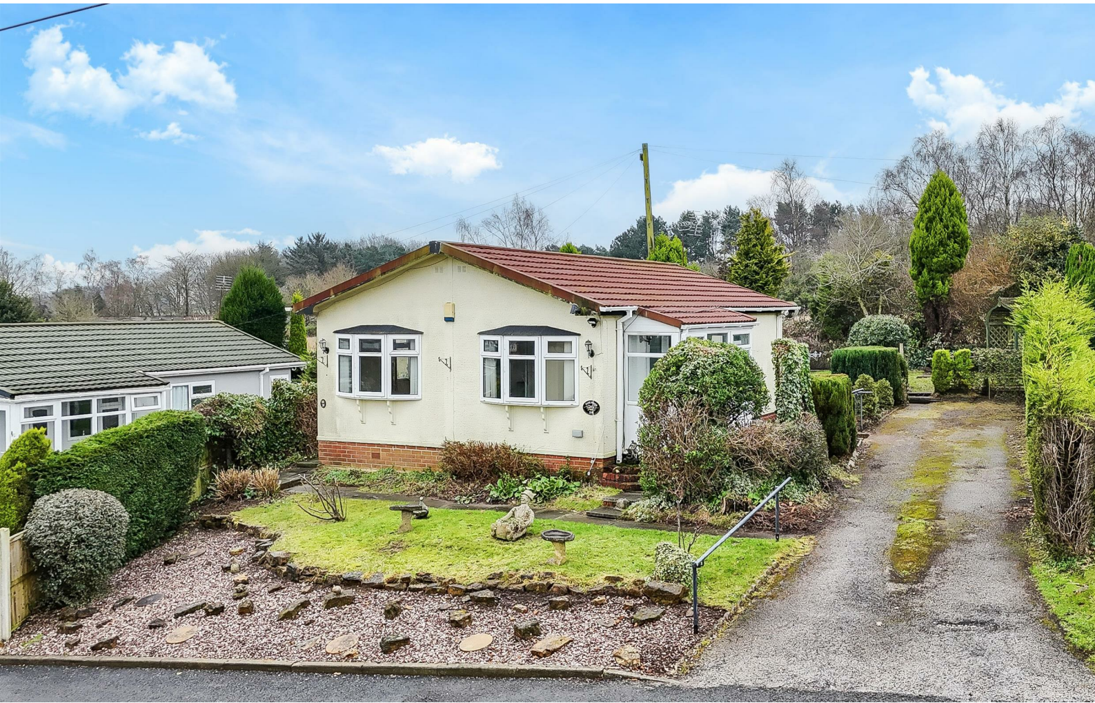
Knightwood Drive, Killarney Park, Killarney Park, Nottinghamshire NG6 8WX