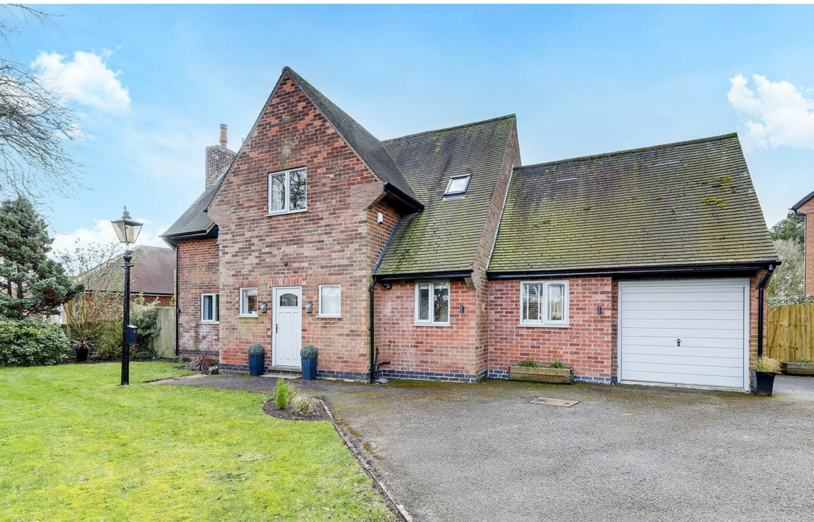
Vernon Crescent, Ravenshead, Nottinghamshire NG15 9BL