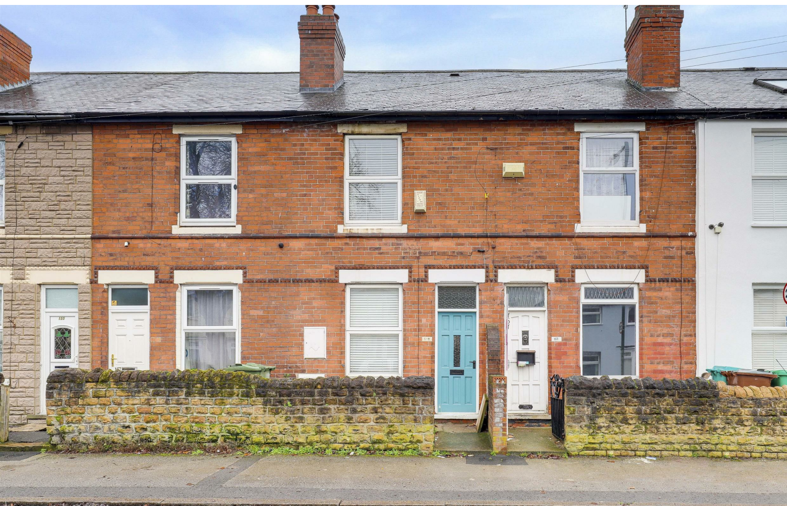
Bobbers Mill Road, Bobbersmill, Nottinghamshire NG7 5JS