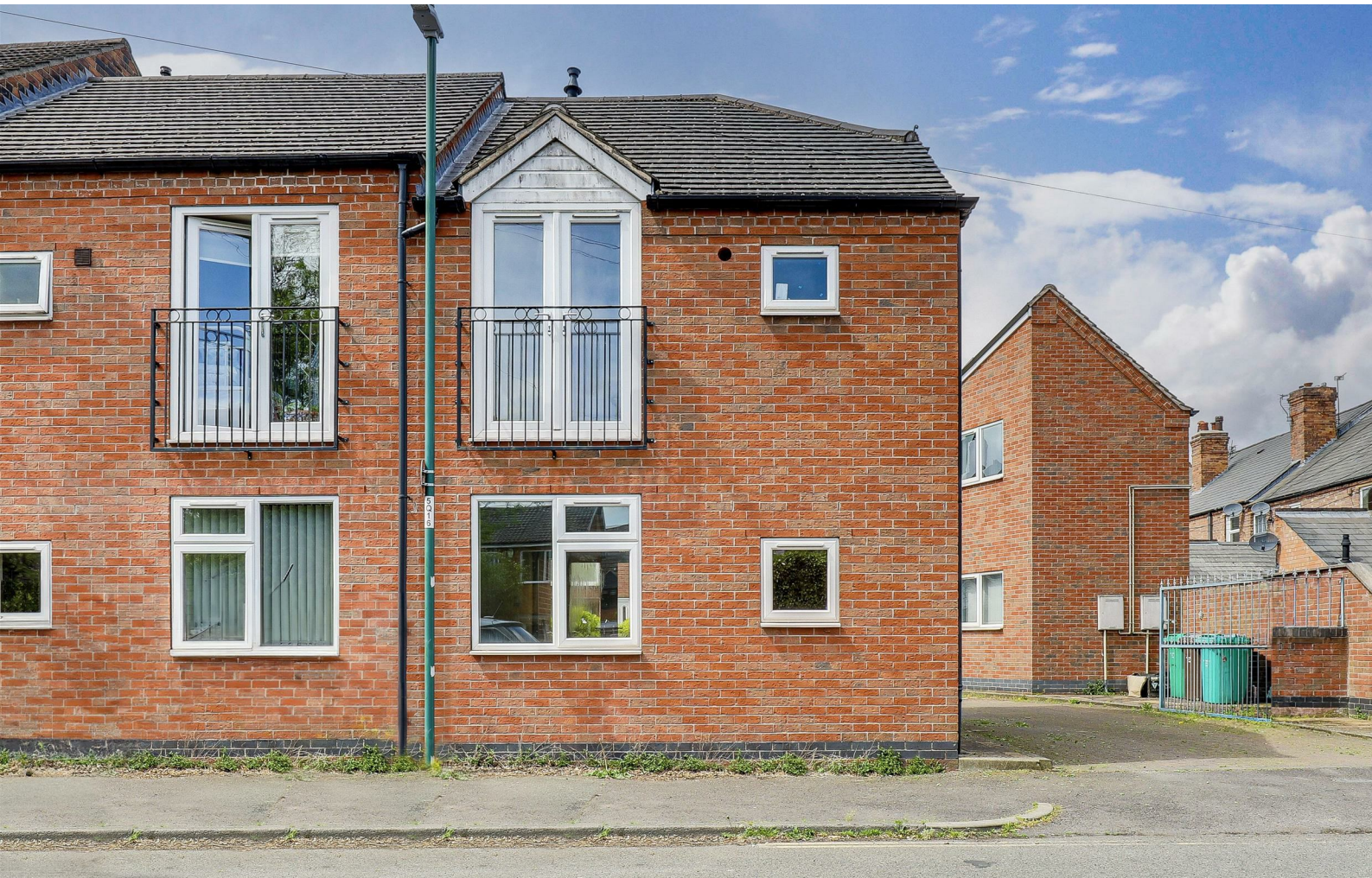
Shires Drive, Querneby Road, Nottingham, Nottinghamshire NG3 5JJ