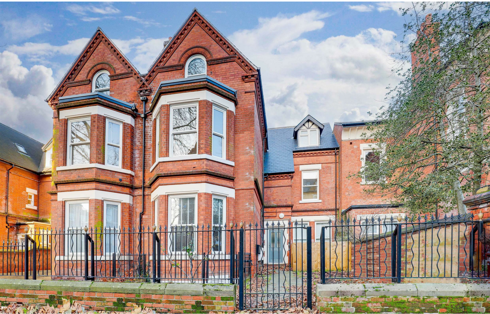
Forest Road West, Nottingham, Nottinghamshire NG7 4EQ