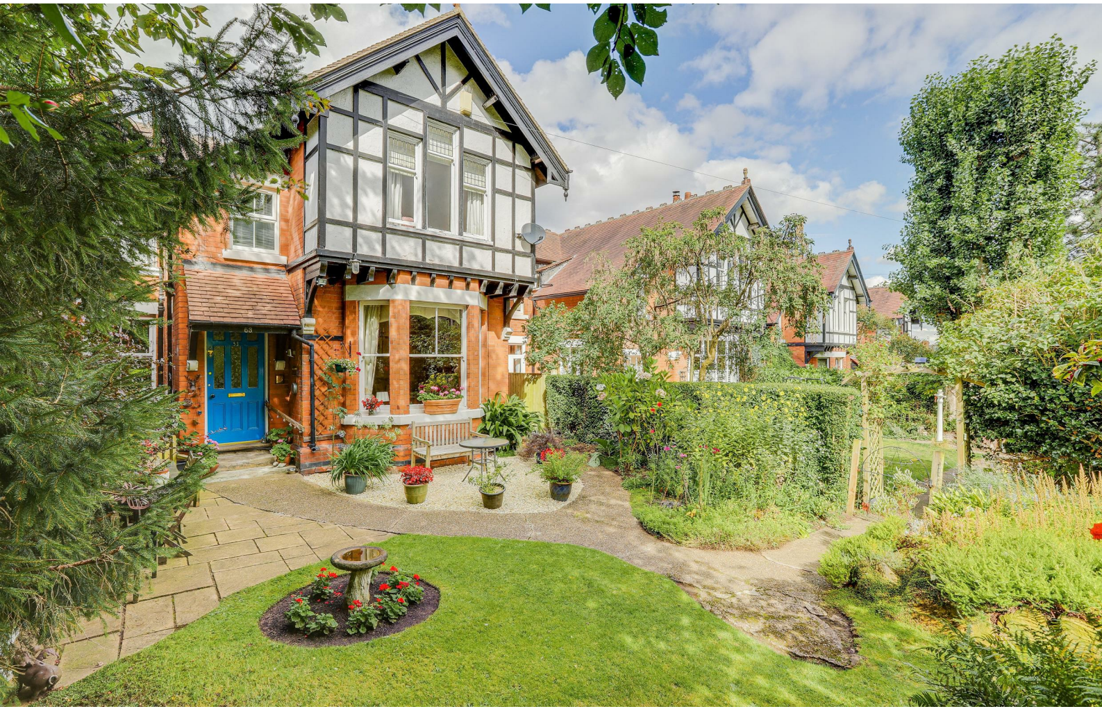
Langtry Grove, New Basford, Nottinghamshire NG7 7AX