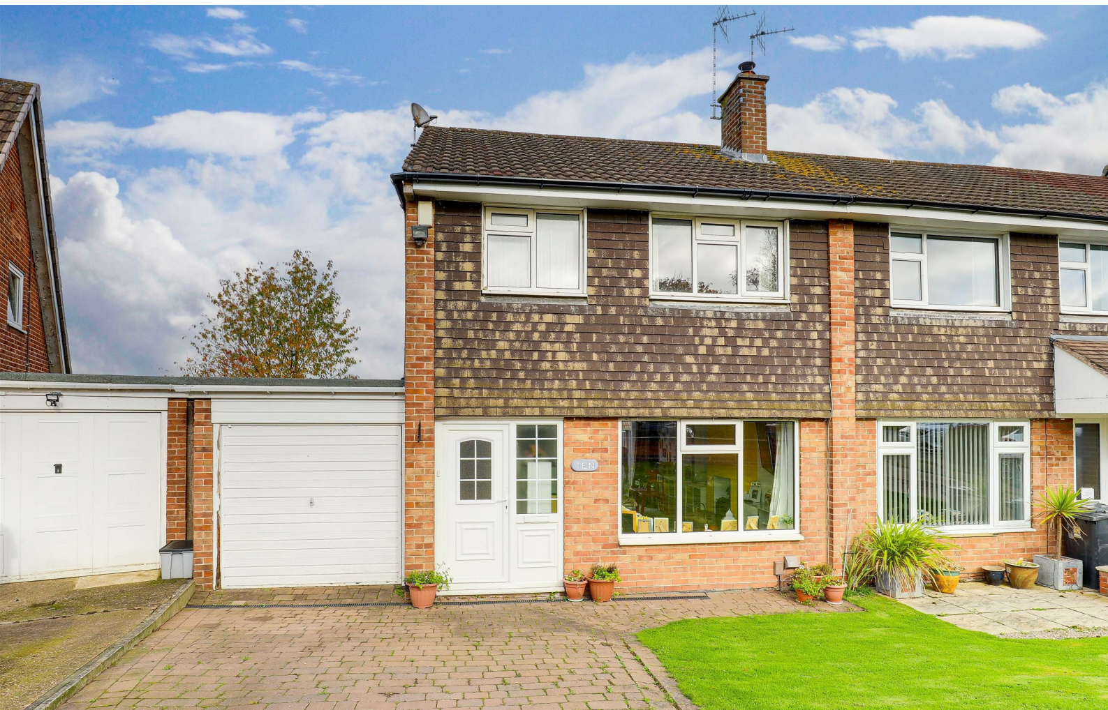
Gorman Court, Arnold, Nottinghamshire NG5 7LR