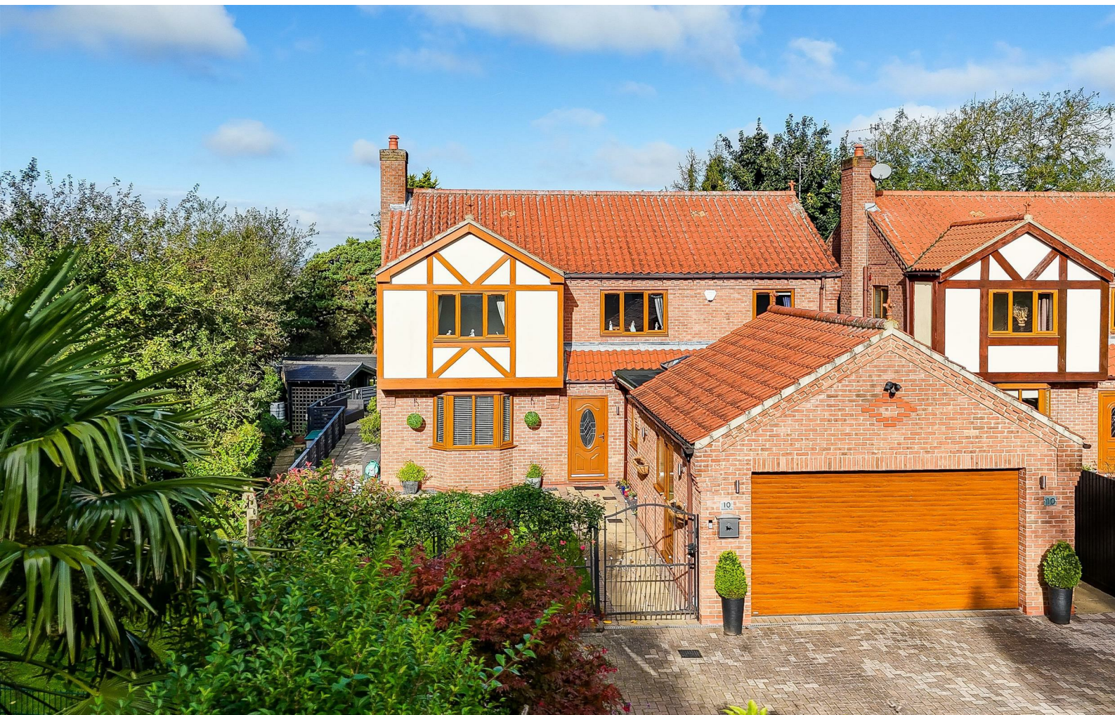
Norfolk Park, Arnold, Nottinghamshire NG5 6PN