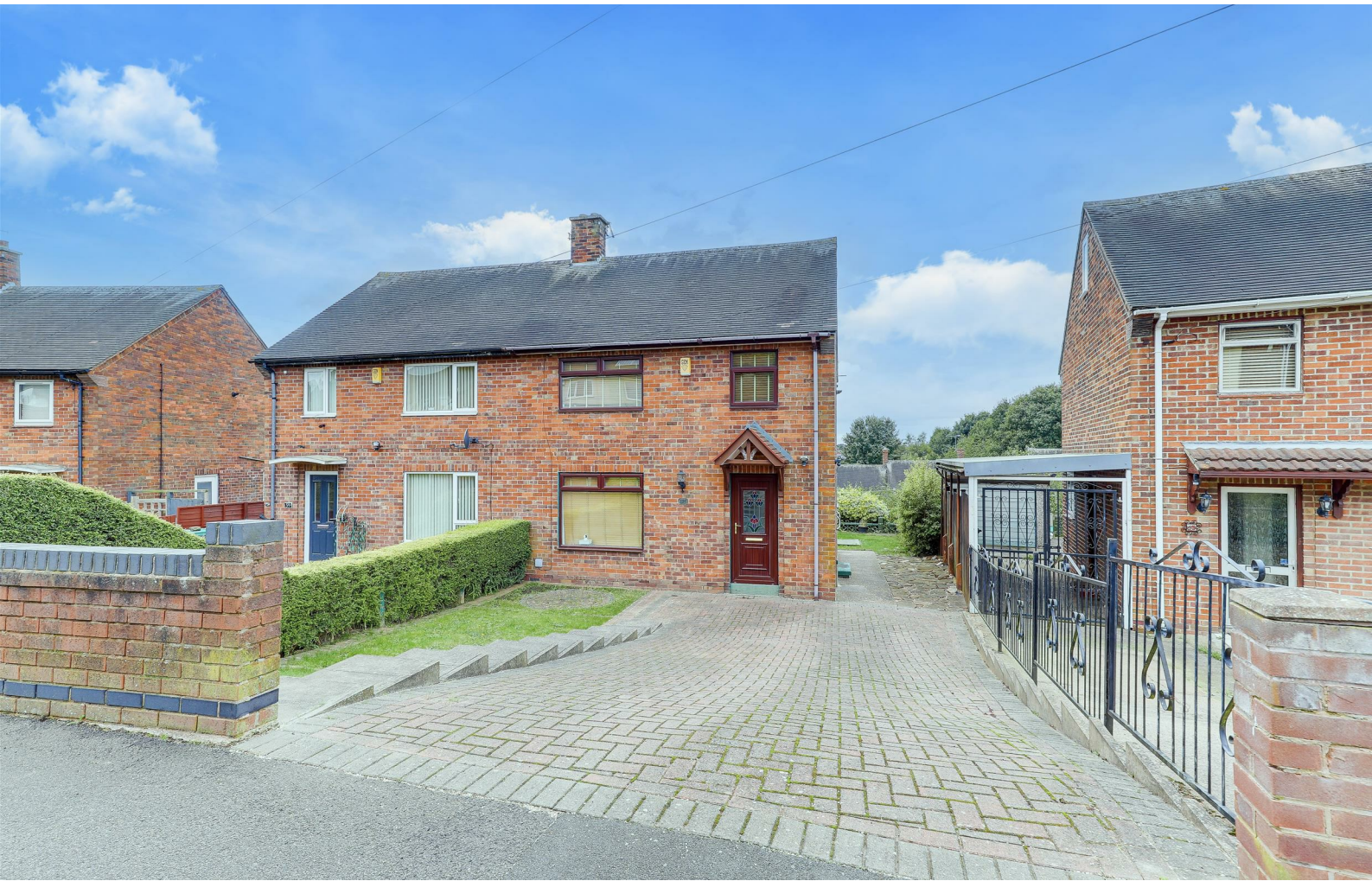
Mosswood Crescent, Bestwood Park, Nottinghamshire NG5 5ST