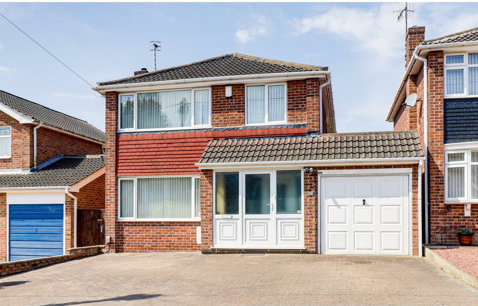
Ornsay Close, Rise Park, Nottinghamshire NG5 5DL