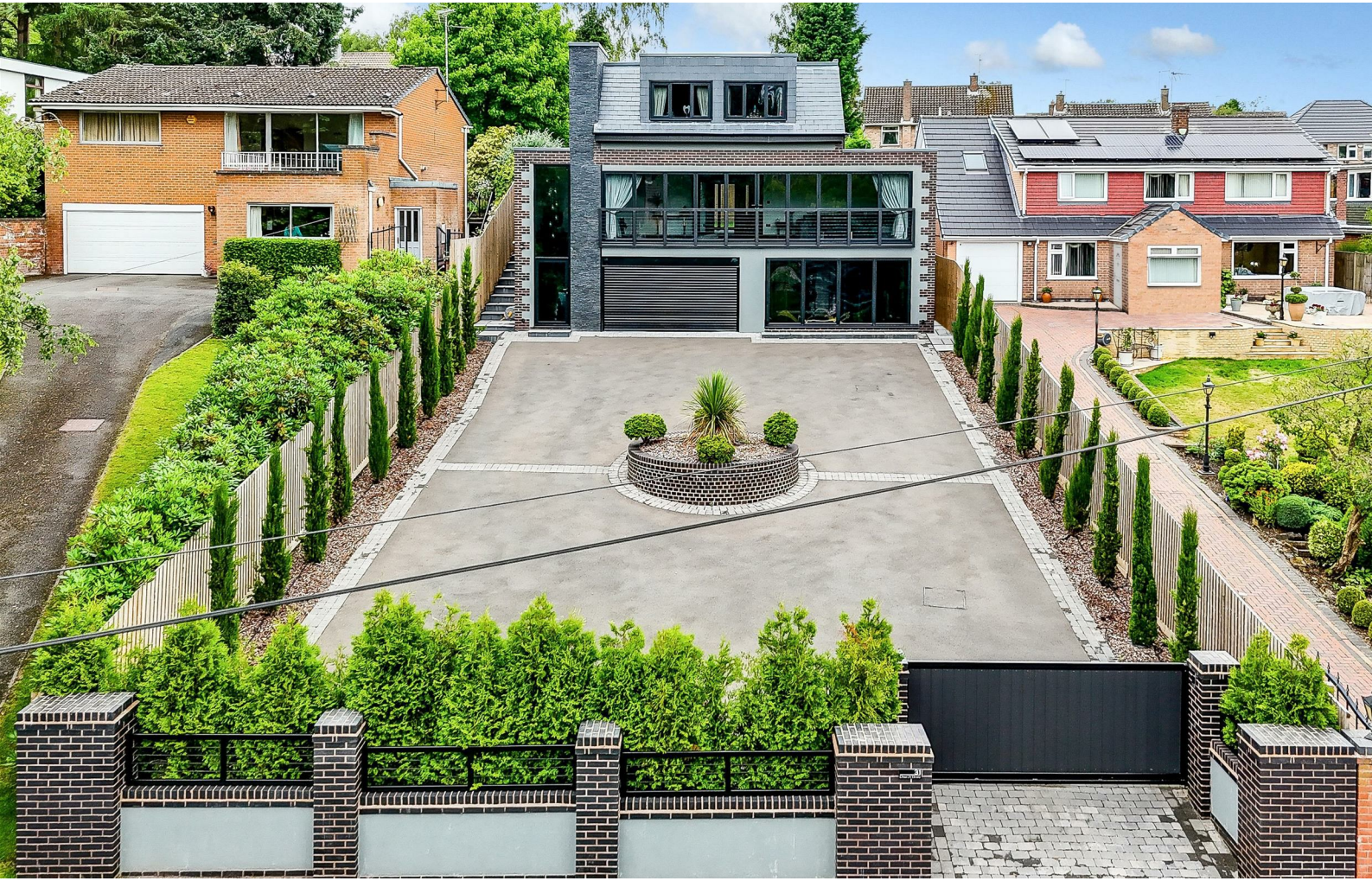
Church Drive, Ravenshead, Nottinghamshire NG15 9FG