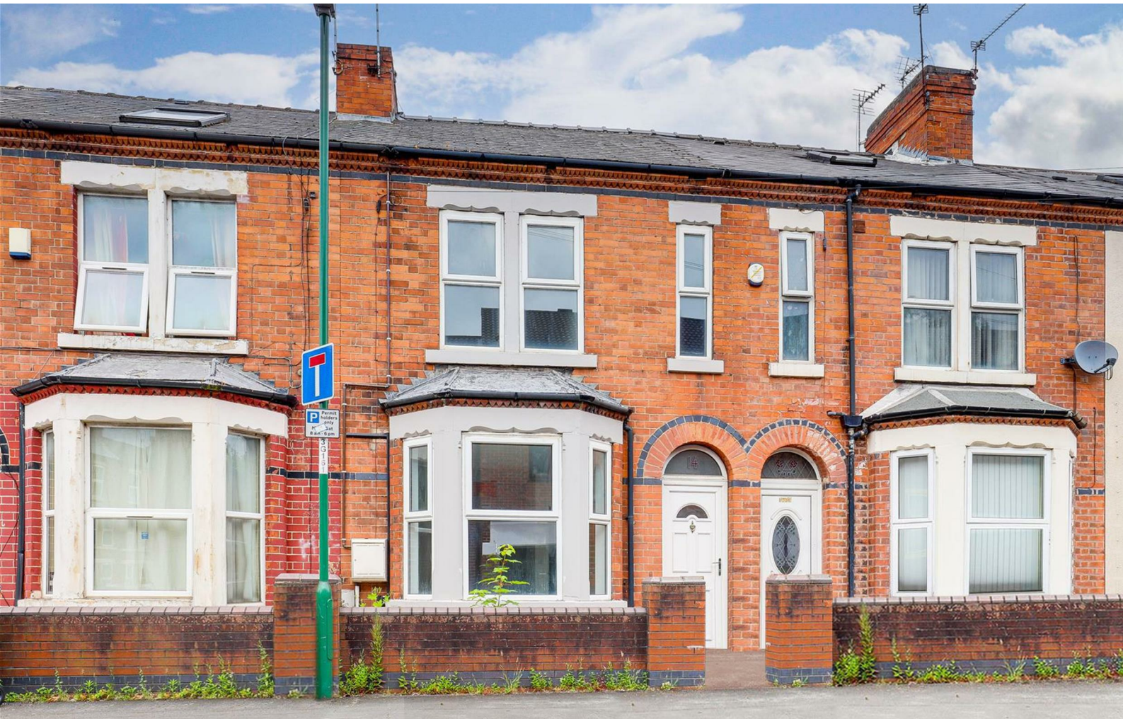
Grove Road, Lenton, Nottinghamshire NG7 IHJ